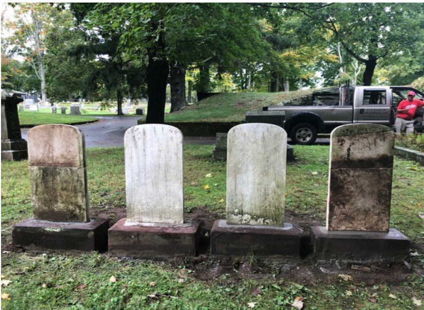
Before and after photos of historic grave markers in the Center Cemetery

Questions? Contact Adam Moon at moona@wrenthamschools.org