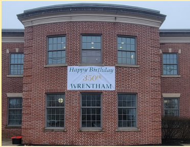
Happy 350th Birthday Banner at Town Hall

The 350th Committee has been busy planning events that will take place throughout 2023!