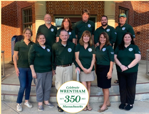
The 350th Anniversary Committee