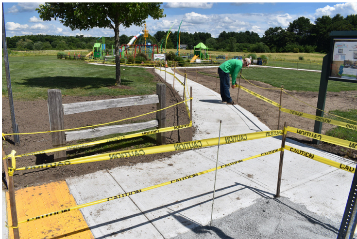
ADA improvements made at Rice Complex (above and right) thanks to a grant received by the Town. In addition to accessible sidewalks, a large concrete pad (below) was created for future programming and events.