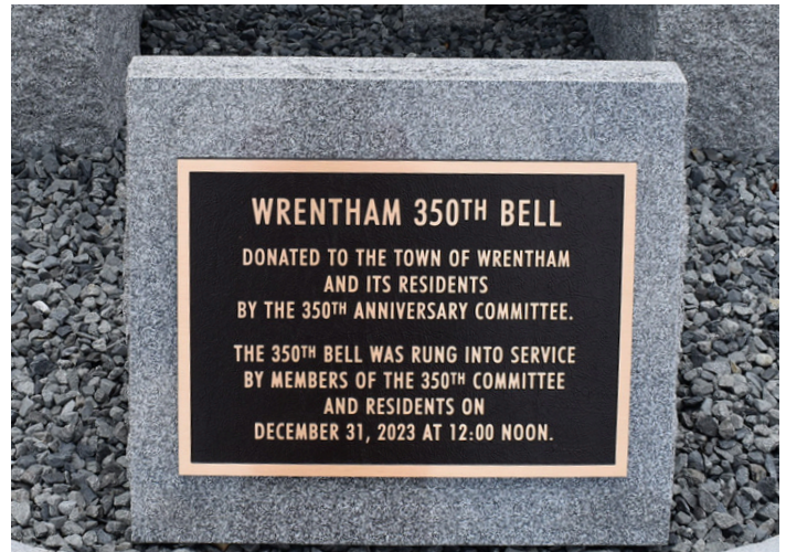
Dedication on commemorative plaque