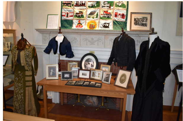
One of the fashion displays at the "Living in a Material World" Exhibit at the Old Fiske Museum co-curated by the Wrentham Cultural Council and Historic Commission.